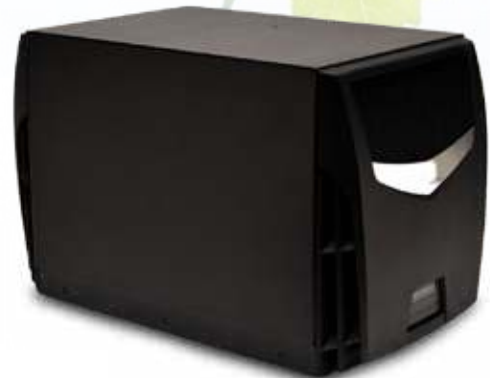
TTW unit out of racking