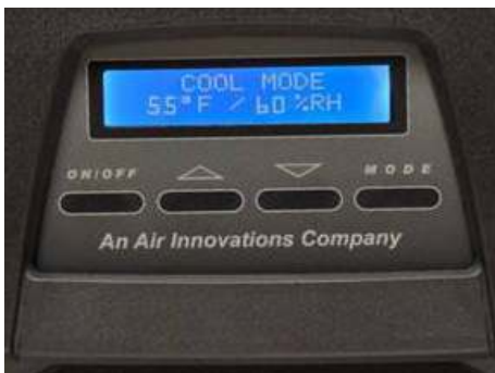
Front Digital Display