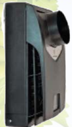
Back View With Optional Duct Adapter