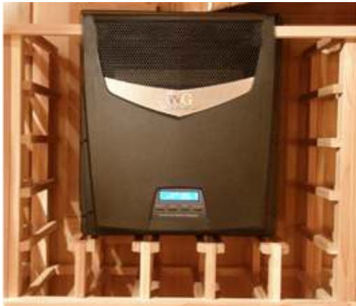
Front View in Racking